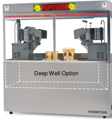
General 79" Enclosed Cornado with Deep Well Option shown for image reference only.