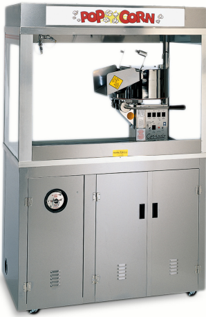
General 48" Enclosed Cornado shown for image reference only.