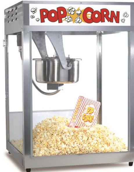
General image shown for reference.