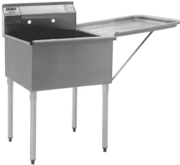
detachable drainboard shown attached to utility sink*

Eagle Detachable Drainboard for Utility Sink, model _____ . Constructed of type 304 or 430 stainless steel with die-stamped rolled rim construction. Left or right hand operation. Furnished with easy clip on installation.