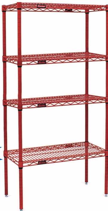
shelves and posts assembled – with red epoxy finish