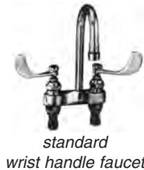
standard wrist handle faucet