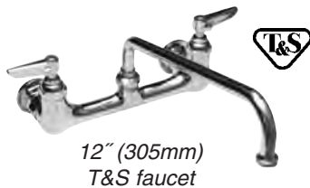
12" (305mm) T&S faucet