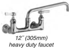
12" (305mm) heavy duty faucet