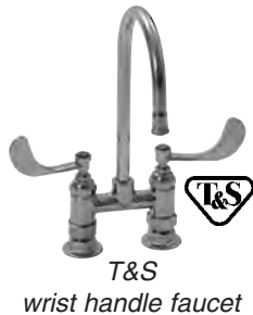
T&S wrist handle faucet