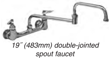
19" (483mm) double-jointed spout faucet