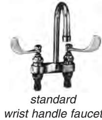
standard wrist handle faucet