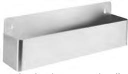
single-tier speed rail