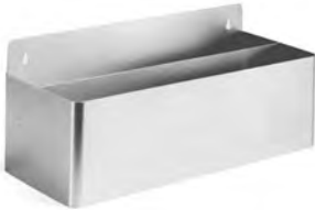
double-tier speed rail