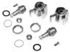
#313975 faucet repair kit