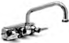
#313302 T&S faucet