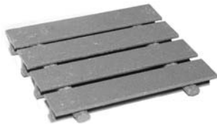
ADA-approved wide "T" Bar fiberglass grating