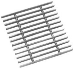
stainless steel grating