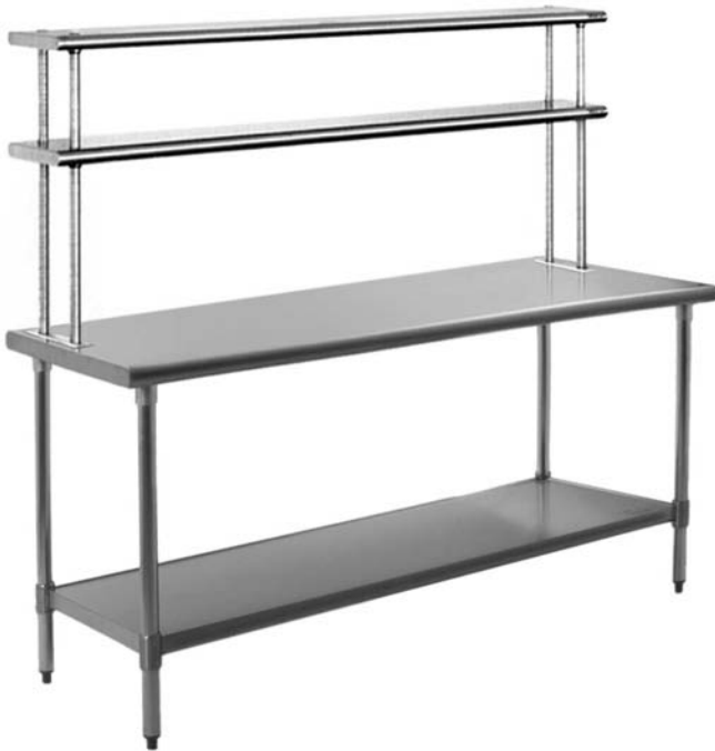
worktable shown with Flex-Master® overshelf system

Eagle Flex-Master® Overshelf System to consist of 10"- or 12"- wide shelves—16/430 or 16/304 stainless steel, adjustable in 1" increments without the use of tools. Shelves feature split sleeves with a tapered collar for mounting onto posts. Stainless steel posts include mounting plates. Optional stainless steel pot hooks and utility racks available.