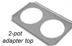
2-pot adapter top