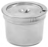
round inset and lid