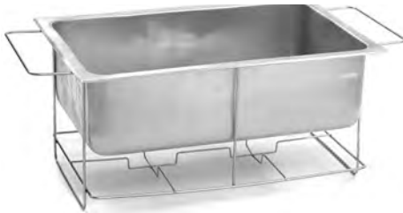
wire chafing frame with spillage pan