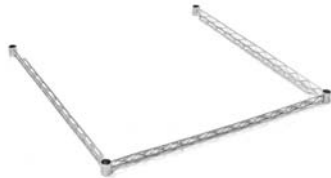
3-sided double truss frame