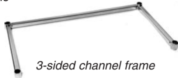
3-sided channel frame