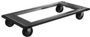
aluminum truck dolly

Includes designated casters and wraparound bumpers. Poly tread.