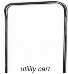
utility cart handle