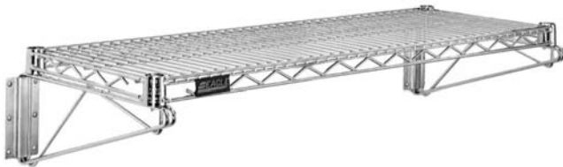
#GWB1436C wire wall shelf kit