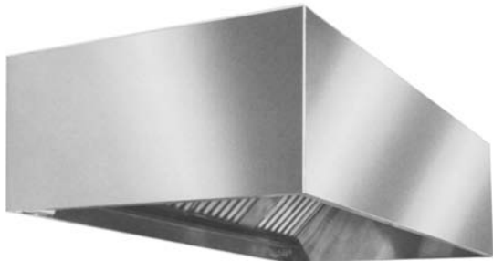
regular exhaust-only hood model #HEB96-66

Eagle SPEC AIR® (Regular, Short Front) Ventilation Hood, model _____. Exposed surfaces to be heavy gauge type 430 stainless steel. Constructed per NFPA 96 with all seams welded liquid tight. Furnished with full length stainless steel grease trough; grease container; UL classified aluminum removable filters; UL vapor-proof incandescent light fixture; 3" air space at rear, front and rear hanger brackets; and exhaust collars.