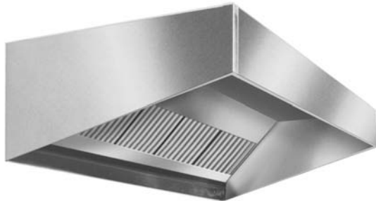
exhaust-only hood with short front fascia model #HES96-66 (for low ceiling applications)