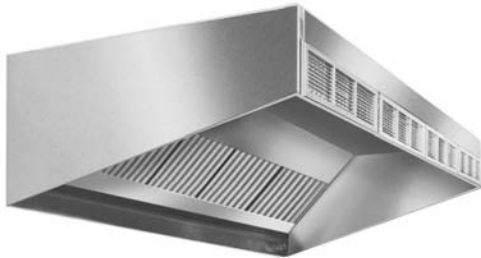
hood with short front fascia—model #HESFA96-66