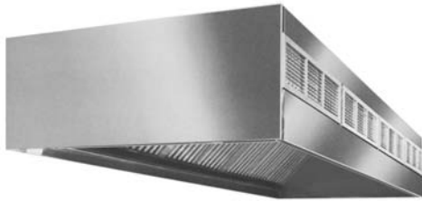
regular hood—model #HEF96-66

Eagle SPEC AIR® (Regular, Short Front) Front Discharge Make-Up Air Ventilation Hood, model _____. All heavy gauge type 430 stainless steel. Constructed per NFPA 96 with all seams welded liquid tight. Make-up air supplied through the hood, independent of ventilation system. Furnished with full length stainless steel grease trough; grease container; UL classified aluminum removable filters; UL vapor-proof incandescent light fixture; 3" airspace at rear, front and rear mounting channels; exhaust and supply collars.