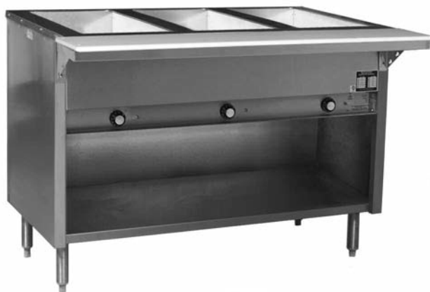
#HT3OB-120 unit with open front

Eagle Hot Food Tables, Spec-Master® series, model _____ enclosed base design. Top and body to be heavy gauge type 430 stainless steel (Open Front or Sliding Doors). Beaded top openings to be 12½" x 20½". Heating compartments to be 8" deep, galvanized, and insulated on all four sides and bottom with 1" fiberglass or equal. Recessed control panel with individual thermostatic controls. Each compartment fitted with 750-watt tubular heating element above the insulated bottom. Wiring terminates at junction box for final field wiring. Complete unit wired to master toggle switch with indicator light. Furnished with polycarbonate cutting board. 7½" high legs are 1½" O.D. stainless steel tubing with adjustable non-marking plastic bullet feet.