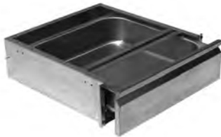
SPEC-MASTER® heavy duty drawer assembly