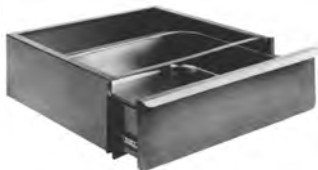
enclosed drawer assembly

* Holes are predrilled for 20" x 20" drawers only.