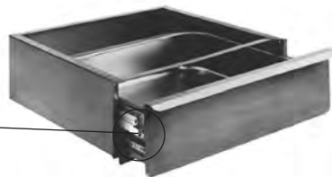
drawer assembly with NSF-approved slides