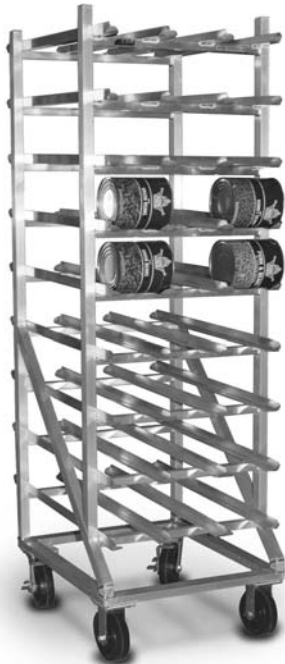
model #OCR-10-9A mobile can rack

Eagle Panco® Full Size Mobile Can Rack, model OCR-10-9A. All-welded aluminum construction, crossbraced front-to-back and side-to-side. Aluminum angle rack slides secured to frame at a slight angle to allow for gravity feed. Furnished with 4"-diameter casters. Capacity: 162 #10 cans or 216 #5 cans.