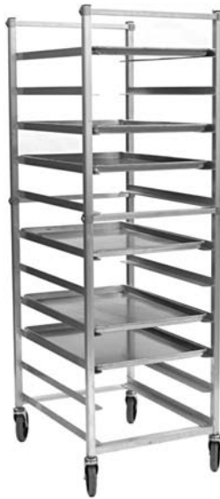
18 series rack

Eagle Panco® 18 Series Deluxe Pan Rack, stainless steel model _____. Stainless steel frame and cross supports are 1" square stainless steel tubing with all-welded construction. Slides are heavy gauge stainless steel, 1½" with raised bead to minimize friction, riveted to vertical uprights. Slide spacing to be 5", 3", or 2¼" to accommodate (11, 18, 20 or 24) full size sheet pans. Units feature front-to-back and side-to-side crossbracing. Furnished with 5"-diameter swivel casters. Shipped assembled.