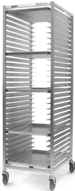
all-welded unit #OUR-1830-2/W

Constructed of 1" square tubular aluminum frame and supports. 1 1/2" x 1 1/2" extruded aluminum tray slides with two raised beads to minimize friction. Slides are welded to vertical posts. Slide spacing to be 2" to accommodate 30 full size sheet pans. Furnished with 5"-diameter casters. Front-loading and side-loading models available. Shipped assembled. 69 1/4" height and features open top.