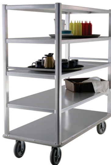
aluminum banquet cart