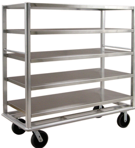
stainless steel banquet cart