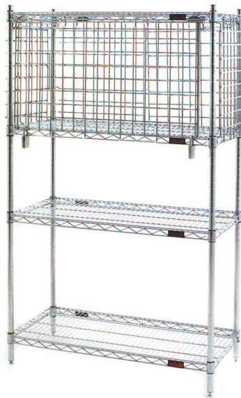
security module with flip-up door— shown assembled to wire shelf unit