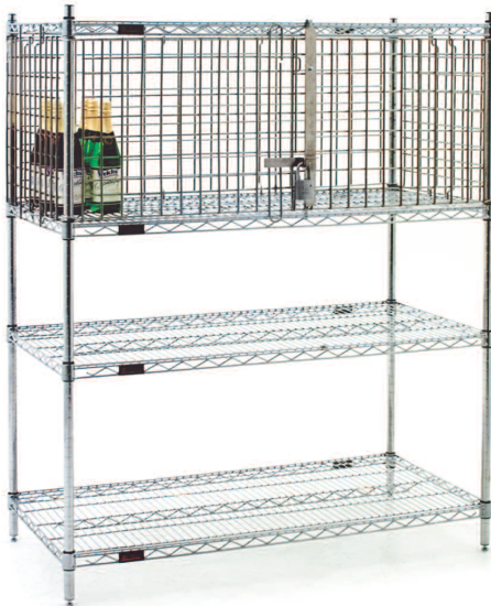
security module with hinged doors— shown assembled to wire shelf unit