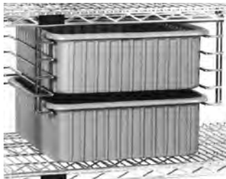
slide system with tote boxes