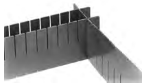
tote box dividers