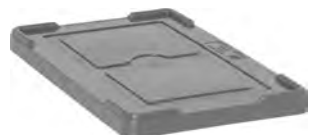
tote box cover (for TB1016 and TB1722 series)