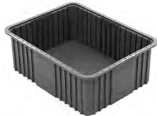
TB1016 and TB1722 series

*Model #A208513 lid fits models A208506, A208507, and A208508 stacking boxes.