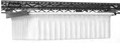
adjustable undershelf slides with tote box