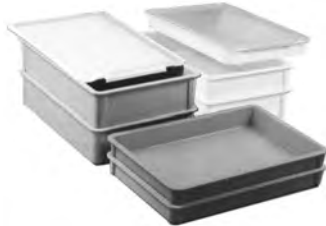
assorted molded fiberglass boxes and trays