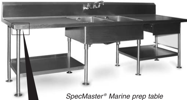
SpecMaster® Marine prep table

Eagle Spec-Master® Marine Prep Table, model _____. Top to be 14/304 stainless steel with box marine edge on front and sides, and 10" backsplash with a 2" return at 45° and turned down 1". Constructed with uni-lok® patented gusset system with the gussets recessed into the hat channels to reduce lateral movement. Two 24" x 18" x 12" deep stainless steel sinks with lever drains, overflows and brackets. Heavy gauge stainless steel undershelf with 2" upturn at rear welded to leg assemblies. 20" x 20" x 5" stainless steel drawer, and 16" x 24" x 1/2" poly cutting board on stainless steel slides welded on outside of unit. Stainless steel tubular legs with stainless steel adjustable bullet feet.