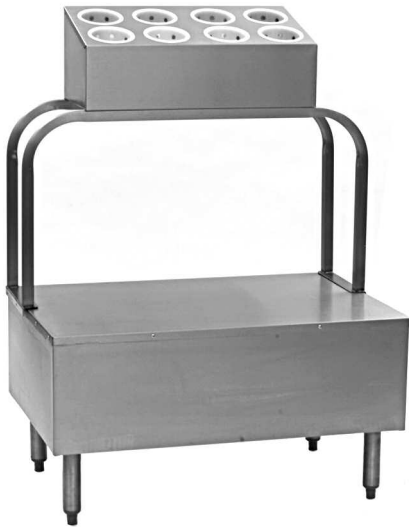
tray stand with optional silverware unit

Eagle Tray Stand, model TU-1. Top to be type 16/430 stainless steel with heavy gauge stainless steel cabinet base, 1 1/2" O.D. stainless steel tubular legs and adjustable bullet feet.