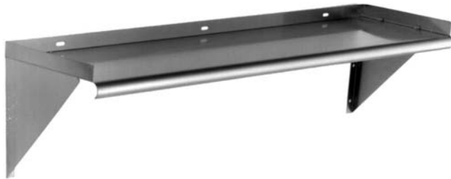
wall shelf with tab lock

Eagle Tab Lock Wall Shelf, model _____. Constructed of 16 gauge type 430 stainless steel, with 1½" roll on front and 1½" upturn on rear and ends. Stainless steel mounting brackets with tab lock for easy assembly.