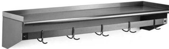
wall shelf with rack

Eagle Wall Shelf with Removable Hooks, model _____ . Shelf is constructed of 16 gauge type 304 stainless steel, with 1½" roll on front and 1½" upturn on rear and ends. 2" x ¾" type 304 stainless steel flat bar. Furnished with double-prong stainless steel removable hooks, one every 12".