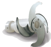
Pesto sauce knives