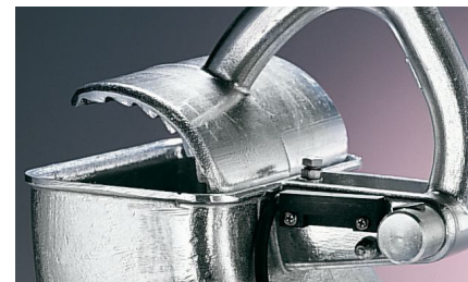
Microswitch on pusher handle Olimpo