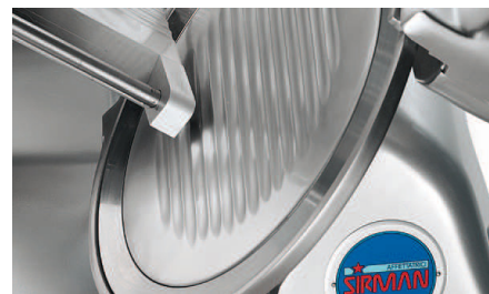
Inner blade cover avoids product waste

Office: 11900 Biscayne Blvd. Suite 512 North Miami, FL 33181 - USA Phone: 305-868-1603 Fax: 305-866-2704