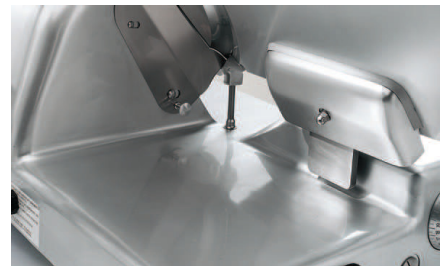
Large receiving tray