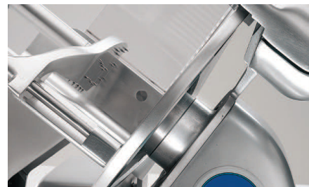
Wide gap between blade and body