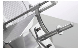
End weight placed underneath carriage for easy cleaning and product loading