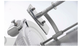
End weight lifted up for easy product loading