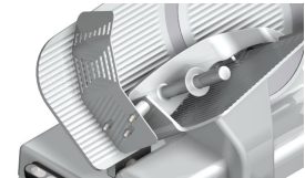
Optional aluminium hand guard