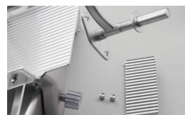
Removable end weight pusher