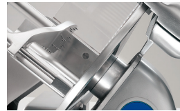
Wide gap between blade and body