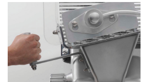
Ergonomic carriage handle