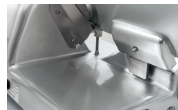
Large receiving tray