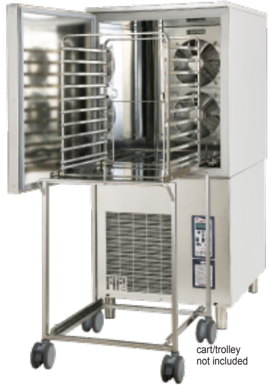
cart/trolley not included