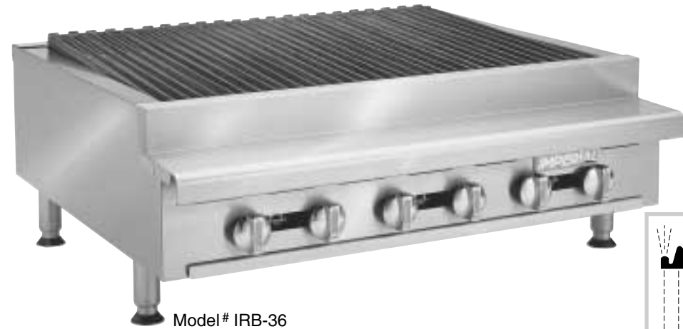
Model # IRB-36