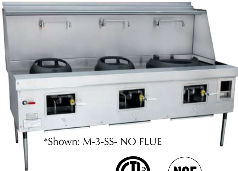
*Shown: M-3-SS- NO FLUE