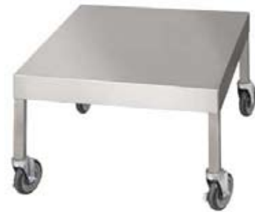
Mobile Stand STSM (92-1021)

JOB NAME: _____ ITEM NO.: _____ NO. REQUIRED: _____