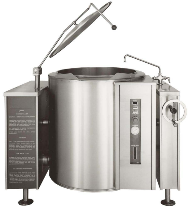
FT-40GL shown with optional Spring assist cover

The kettle construction is stainless steel throughout and built in accordance with the ASME code. 20, 30 and 40 gallon kettles will have 316 type stainless steel liner as standard.