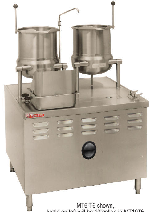
MT6-T6 shown, kettle on left will be 10 gallon in MT10T6