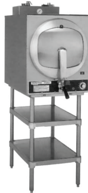
Shown on optional stand with extra shelf