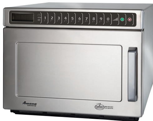
Model HDC18SD2 shown