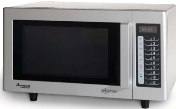
Model RMS10T and RMS10TS shown