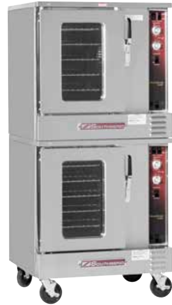
(EH/20SC shown with optional casters)

150°F to 550°F temperature controller with 140°F to 200°F "Hold" thermostat. Dual digital display shows time and temperature. A fan cycle timer pulses the fan.