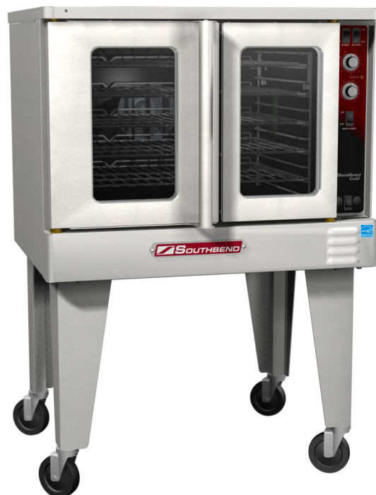
(ES/10SC shown with optional casters)