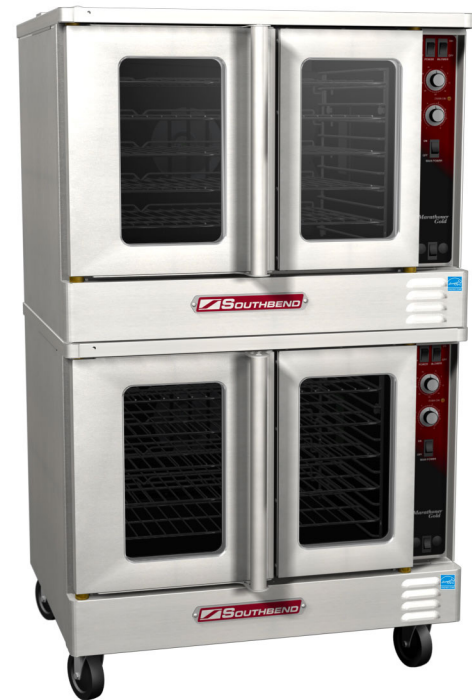
(ES20/SC shown with optional casters)

150°F to 500°F temperature controller with 140°F to 200°F "Hold" thermostat Dual digital display shows time and temperature. A fan cycle timer pulses the fan.