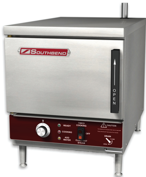
Model shown is an EZ18-3