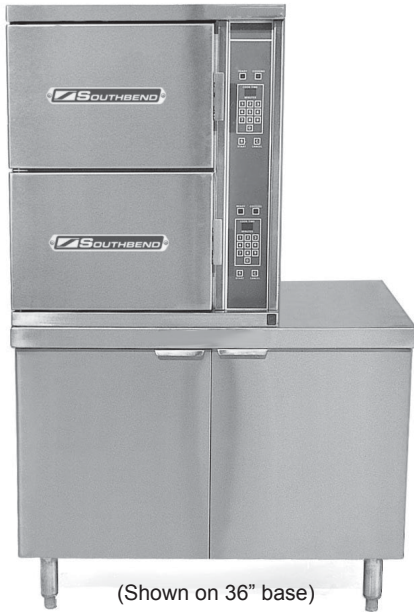
(Shown on 36" base)