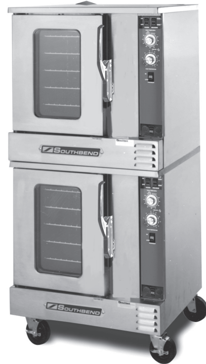
(shown with optional casters)

150°F to 550°F temperature controller with 140°F to 200°F "Hold" thermostat. Dual digital display shows time and temperature. A fan cycle timer pulses the fan.