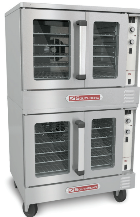
(GS/25SC shown with optional casters)

Comes with NRG system. NRG system units are Energy Star Approved.