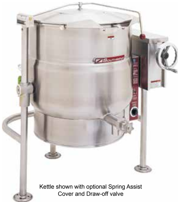
Kettle shown with optional Spring Assist Cover and Draw-off valve