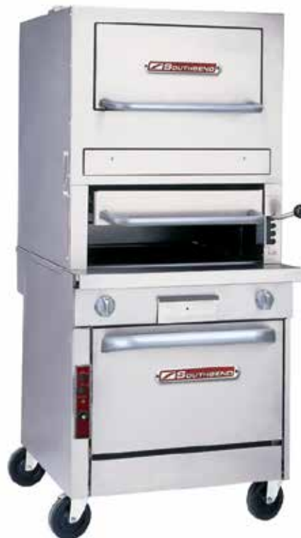
(Model P32D-171 )

P32N-171 (Modular Mount) P32C-171 (Cabinet Base) P32D-171 (Standard Oven Base) P32A-171 (Convection Oven Base)