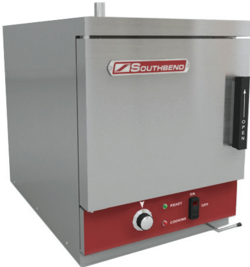
Model shown is an R18-4